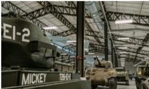
Ordnance Museum Since 2018 (WWII-era Tanks)