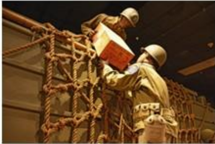
Quartermaster Museum Since 1960