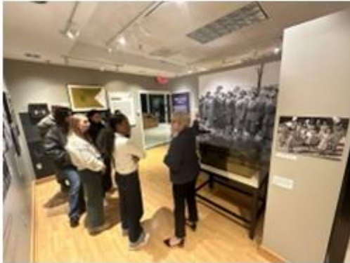
Army Womens Museum Since 2000 (6888 Exhibit)