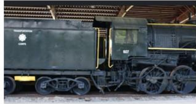
Army Transportation Museum Since 1959 (One of 35 Trains/Heavy Transport)